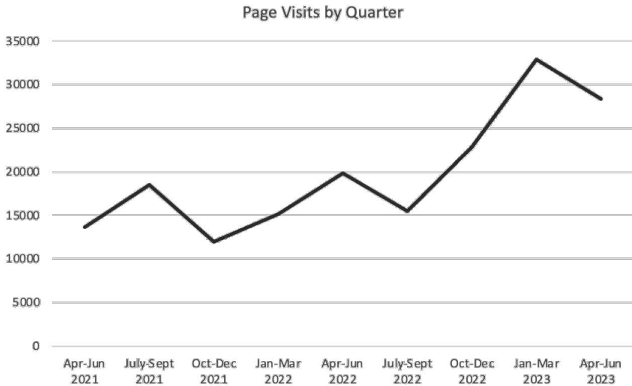
Figure 1. Page visits by quarter.